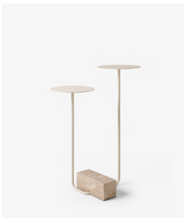
AD02.03 ADOBE TABLE #2 – SAND