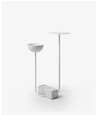
AD03.01 ADOBE TABLE #3 – WHITE