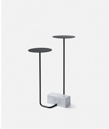
AD02.00 ADOBE TABLE #2 – BLACK