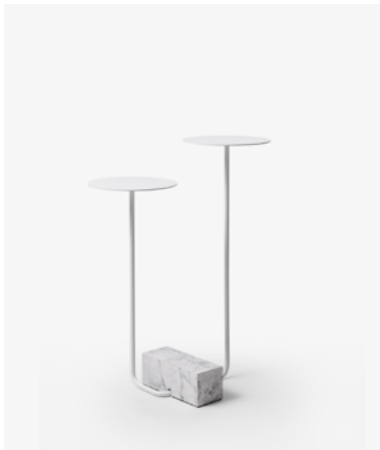
AD02.01 ADOBE TABLE #2 – WHITE