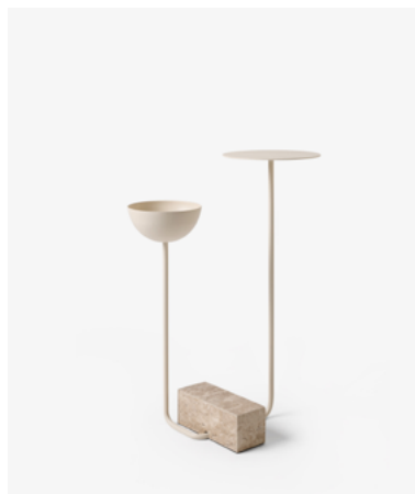
AD03.03 ADOBE TABLE #3 – SAND