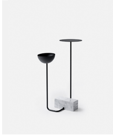
AD03.00 ADOBE TABLE #3 – BLACK