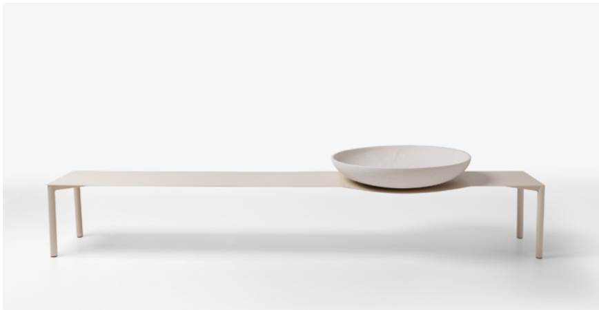
BW03.03 BOWL COFEE TABLE — SAND