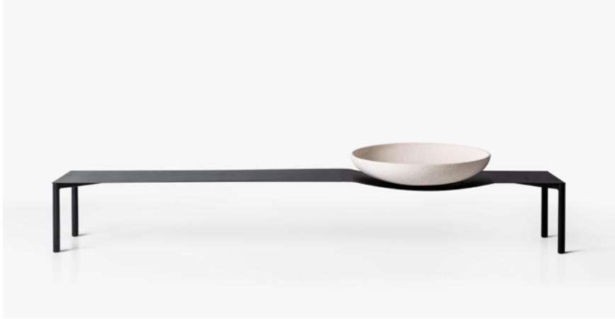
BW03.00 BOWL COFEE TABLE — BLACK