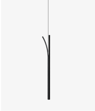
CN01.W.00 CANA PENDANT — BLACK