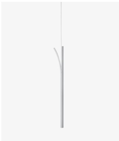
CN01.W.01 CANA PENDANT — WHITE