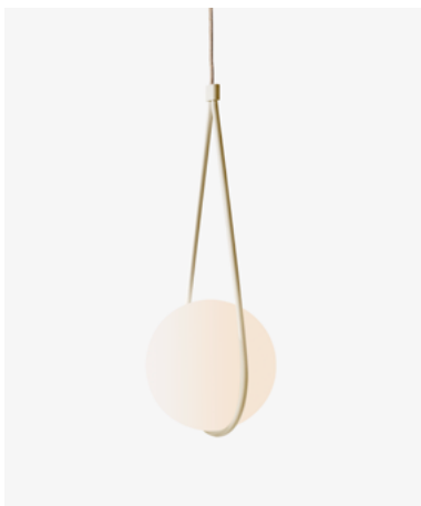
CR01.W03 CORDA PENDANT – SAND