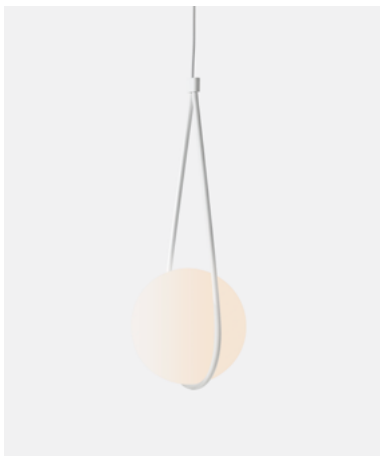
CR01.W01 CORDA PENDANT – WHITE