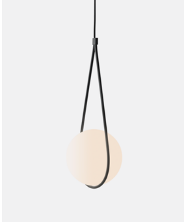
CR01.W00 CORDA PENDANT – BLACK