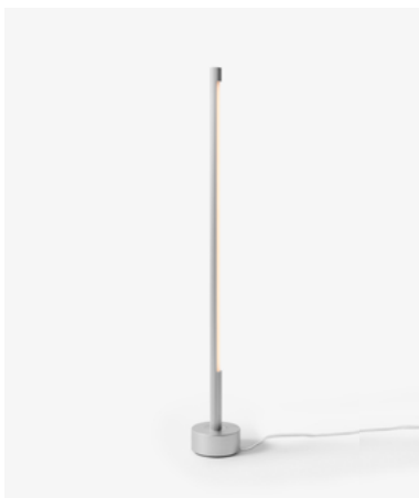
PL11W.91 PALO LAMP — ALUMINUM