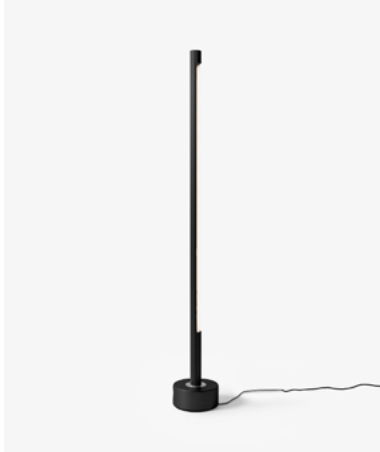
PL11W.00 PALO LAMP — BLACK