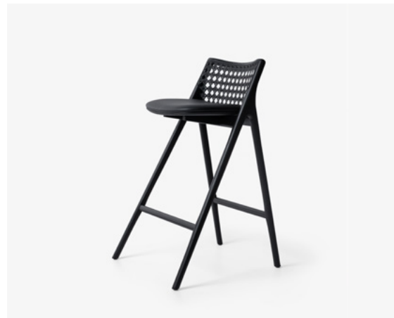
Tela Counter Stool — Black + Black Leather TL21.26.L01