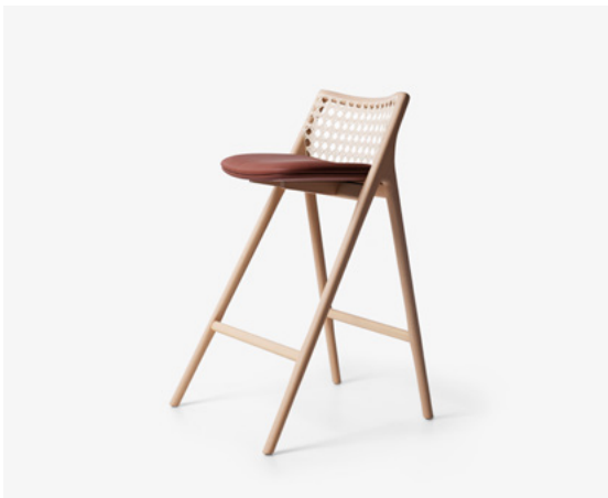
Tela Counter Stool — Bleached Tauari + Terracotta Leather TL21.24.L04