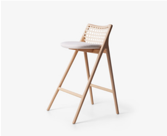
Tela Counter Stool — Bleached Tauari + Off- white Recycled Cotton TL21.24.ECO01