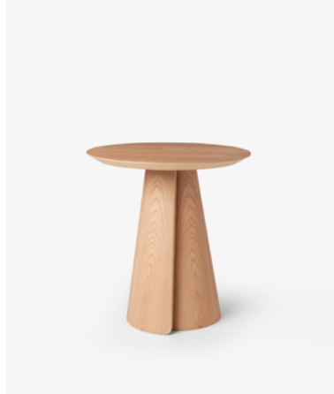
VL21 VOLTA SIDE TABLES