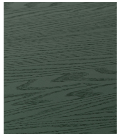
09 LEAF GREEN