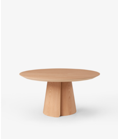
VL11 VOLTA COFFEE TABLES